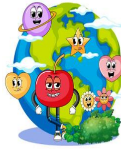
Design Your Planet Class II