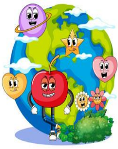
Design Your Planet Class I