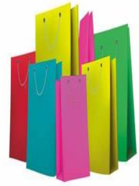
Paper Bag Making Activity Class II