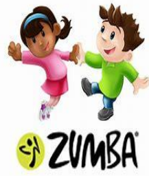
Zumba Class I and II