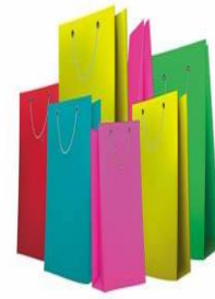
Paper Bag Making Activity Class I